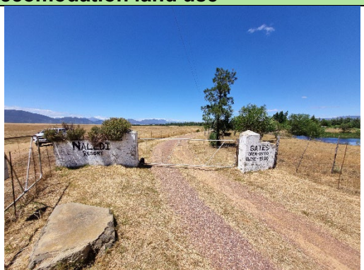
Existing water crossings towards the site – these will not be impacted in any way