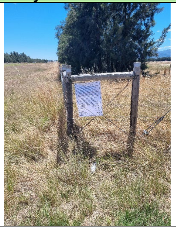
Entrance to site via R44